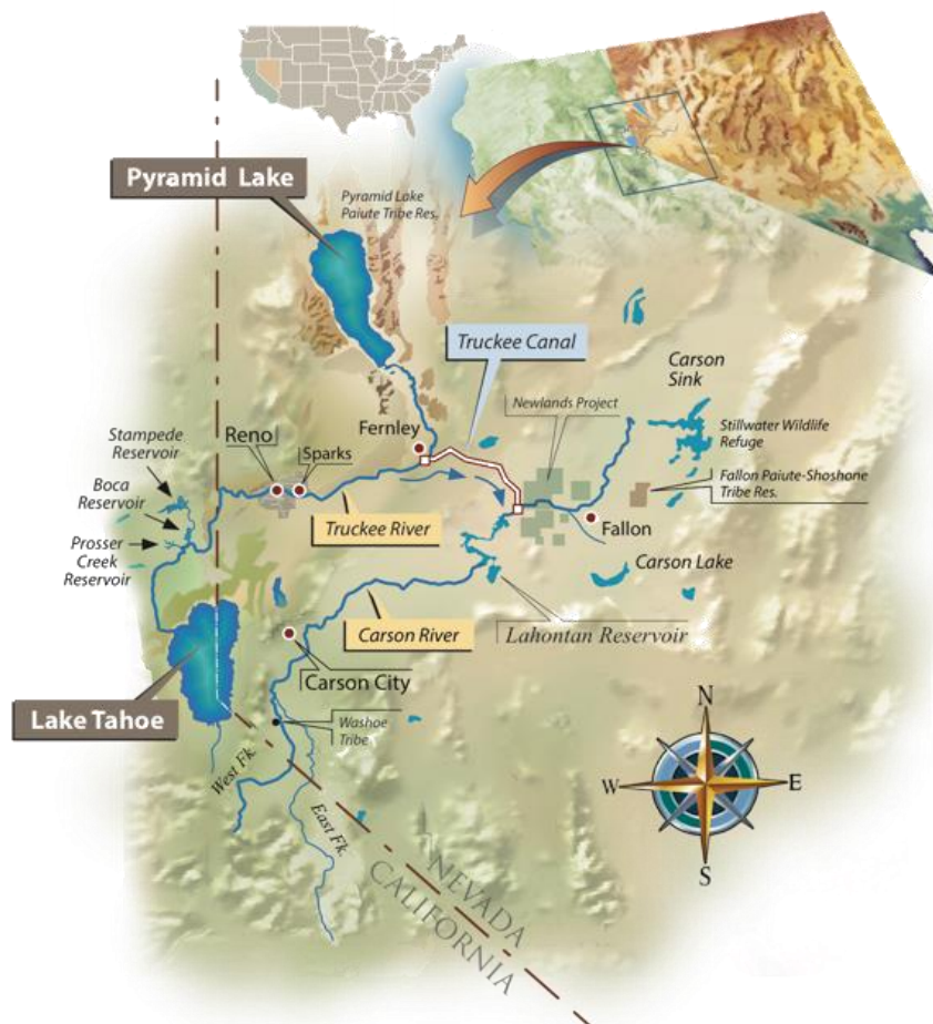
Figure 1. The Truckee-Carson River System. Singletary & Sterle (2017).

A collaborative modeling research program in the Truckee-Carson River System convenes an interdisciplinary research team, including hydrologists and climatologists, with a core group of local stakeholders representing the diverse water-use interests from headwaters to river system terminus (Singletary & Sterle, 2017, 2018). Iterative interactions ensure that research and modeling activities incorporate local stakeholder perspectives and information needs.