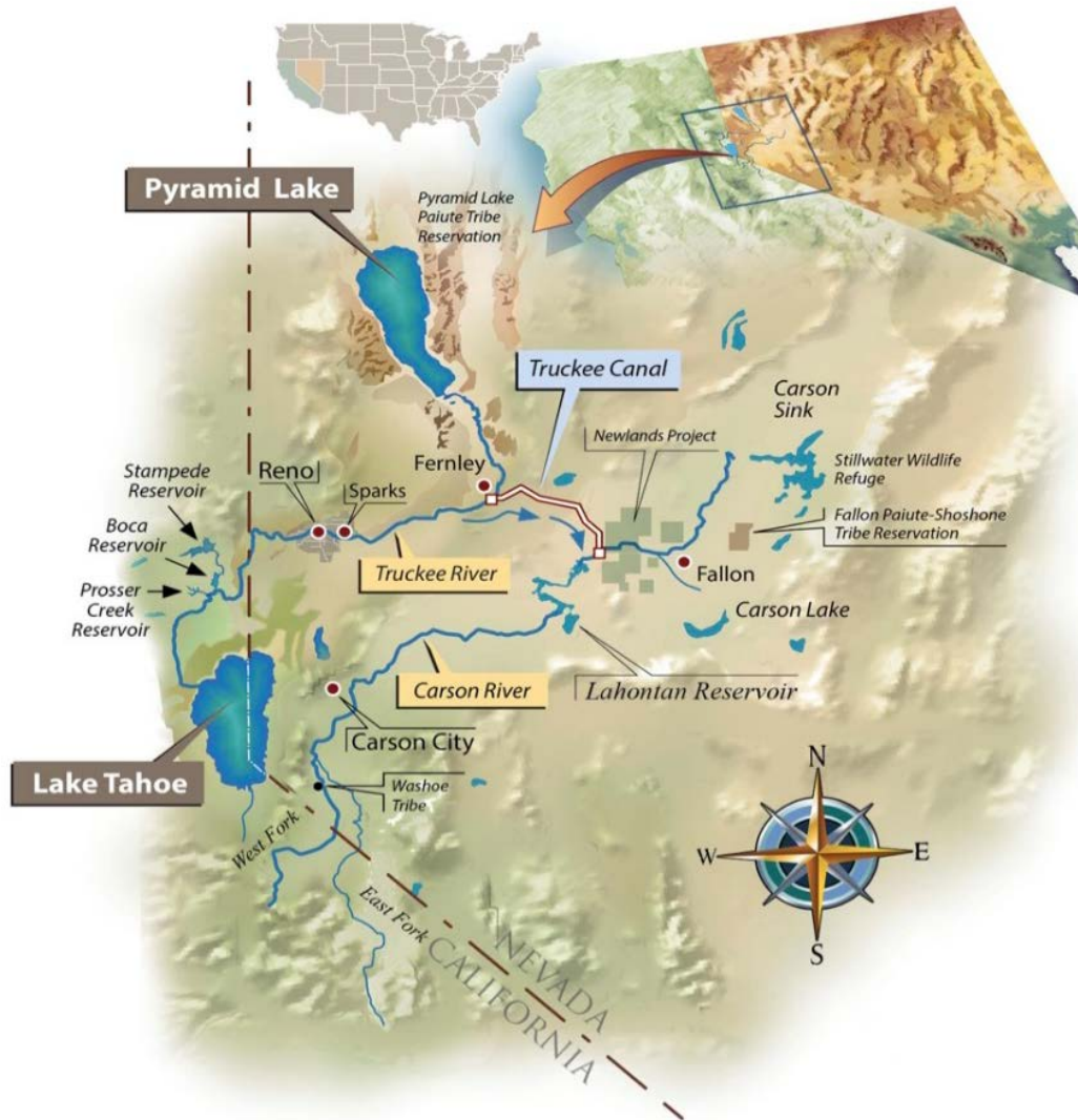
Figure 2. The Truckee-Carson River System (Singletary & Sterle, 2017).

(Lahontan cutthroat trout) fish species in Pyramid Lake, a rare natural desert terminus lake located on the Pyramid Lake Paiute Reservation. The system aspect of the river results from Truckee River surface flows diverted via the Truckee Canal to join Carson River flows to supply water to the Newlands Irrigation Project area, the nation's first desert reclamation project (1906), and environmental use on the Stillwater National Wildlife Refuge (Wilds, 2014).